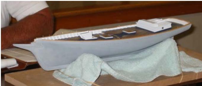
Jan Leung's Smuggler

Jan Leung brought along his work in progress of the Bluejacket kit of the Gloucester fishing vessel Smuggler in 1/4" scale. It looks like most of the deck furniture is installed and the model now needs the masts and rigging.