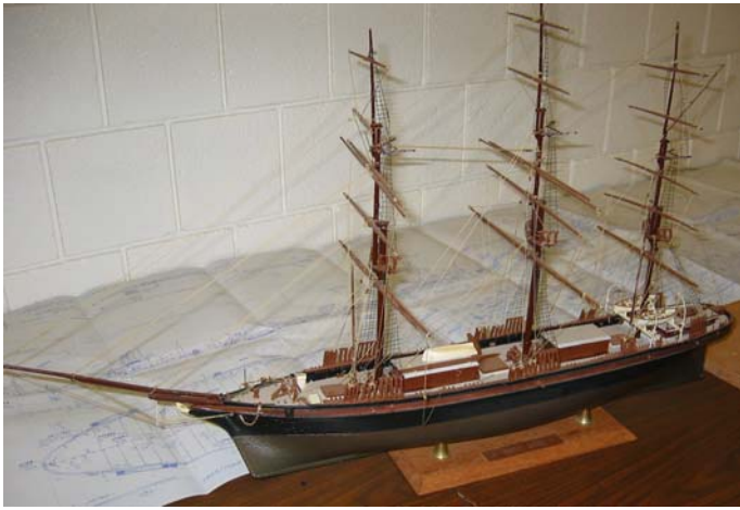
The Unwanted Cutty Sark

Jan Leung brought along his work in progress of the Bluejacket kit of the Gloucester fishing vessel Smuggler in 1/4" scale. It looks like most of the deck furniture is installed and the model now needs the masts and rigging.