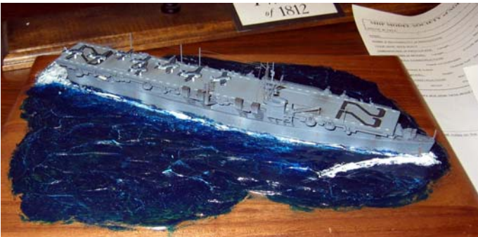
Martin Quinn's Independence

Martin Quinn , although only newly elected to membership, has in past meetings shown many examples of his work in 1/700 and 1/350 scale. Tonight he brought a model of the USS Independence from the Skywave kit in 1/700. The Independence was a cruiser hull converted to a carrier. Martin also showed his first Blue Water Navy kit of the USS Gearing in 1/350 scale.