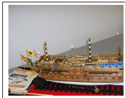
Ernest Connor's San Felipe