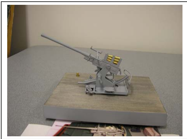
Ossie Thalmann's 37 MM AA gun