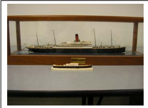
Bob Fivehouse's Minnewaska in 1:384 and 1:1200 scales