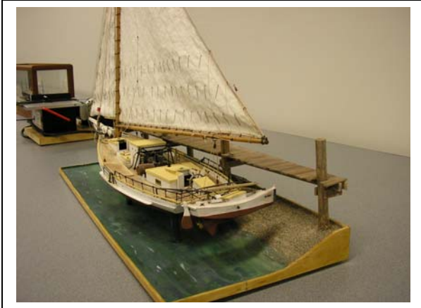
Francois Lachelier's Skipjack