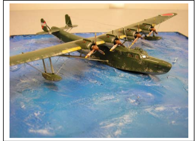
Len Schwalm's Japanese Sea Plane