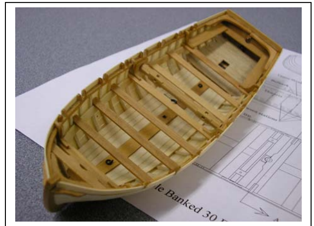
Allan Yedlinski's ship's boat