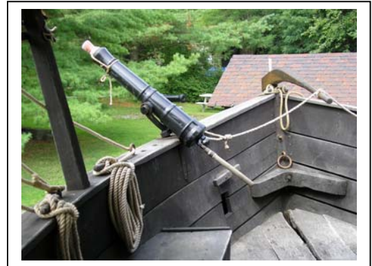
Revolutionary War Gun Boat Philadelphia Lake Champlain Maritime Museum