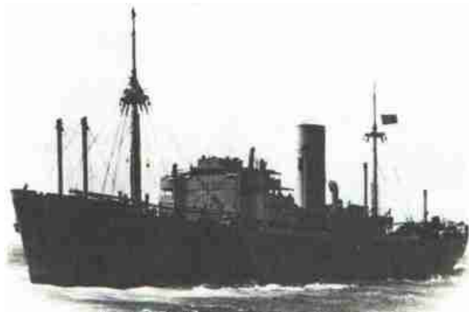
GERMAN RAIDER ATLANTIS