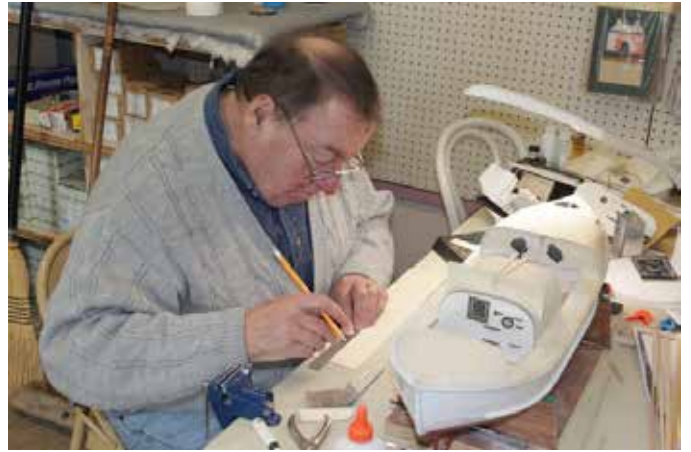
Pure and total concentration...a modeler in his element.