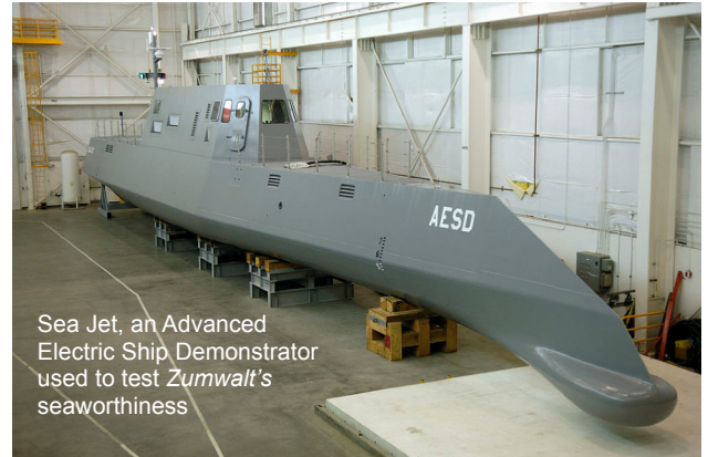
Sea Jet, an Advanced Electric Ship Demonstrator used to test Zumwalt's seaworthiness

uration presents a profile "50 times harder to spot on radar than an ordinary destroyer". This does not come without cost. The jury is still out about how the design will affect stability, especially in high speed turns.