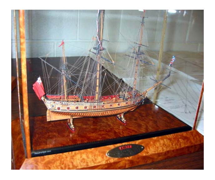
Another Beautiful Case and Mounting Board