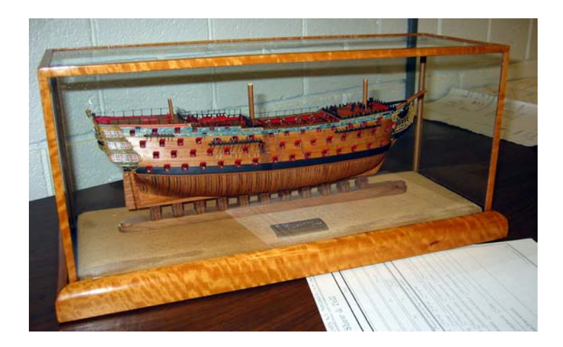
Illustrating Fine Case Work

He discussed the importance of presentation in museum sales, emphasizing the case and mounting, likening it to framing a picture. He also pointed out the importance of documentation to establish and maintain the provenance of the model. In his business he keeps copies of the model documentation.