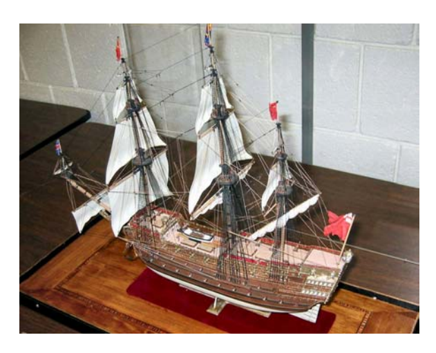
Sovereign Of The Seas Fore, Aft and A-Beam Don Otis showed his work in progress of the Model Expo model of the USS Constitution in 5/32 scale. Don is building the model as it appeared in 1997 when it got underway in Boston under sail. He is pleased with all aspects of the kit so far.