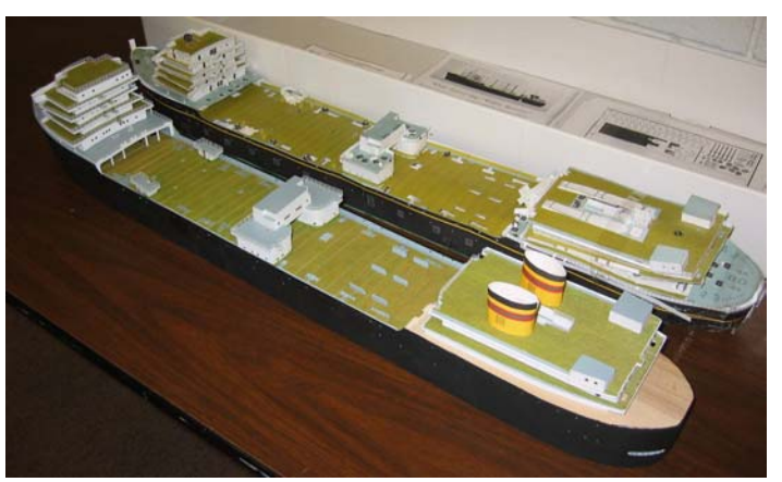
Henry's Paper and Wooden Versions of the Willem Barendsz II

Henry Schaeffer showed his work in progress of the Willem Barendsz II , a whale factory ship built in 1955. Henry is scratch building the waterline model in 1:250 scale and interestingly is using a paper model of the vessel as a guide to the general appearance. A ship of this type would routinely operate with about 16 whale catching vessels that would bring the catch alongside to be processed. Henry intends to show the model with a catch vessel alongside with some whale carcasses.