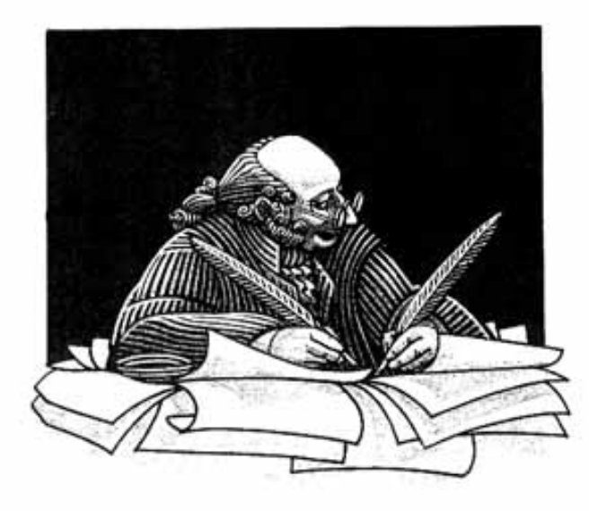
FROM THE EDITOR

As noted at the beginning of this edition, we will be having our annual White Whale Auction at the December meeting on December 16 at 7:00 PM.