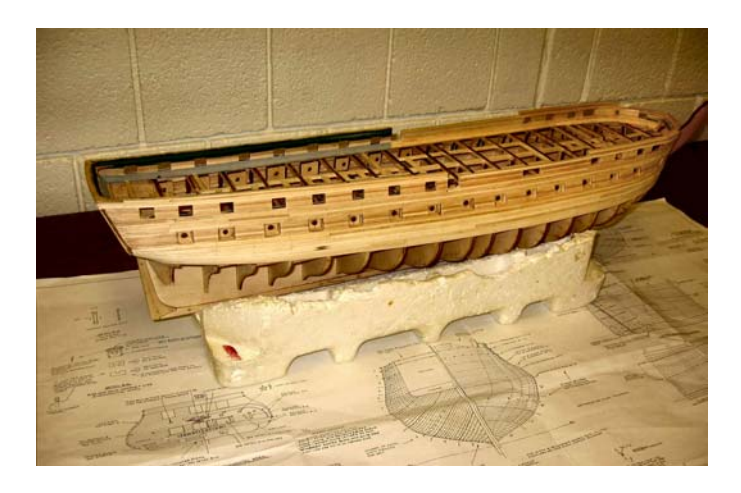
USS Constitution Partially Planked