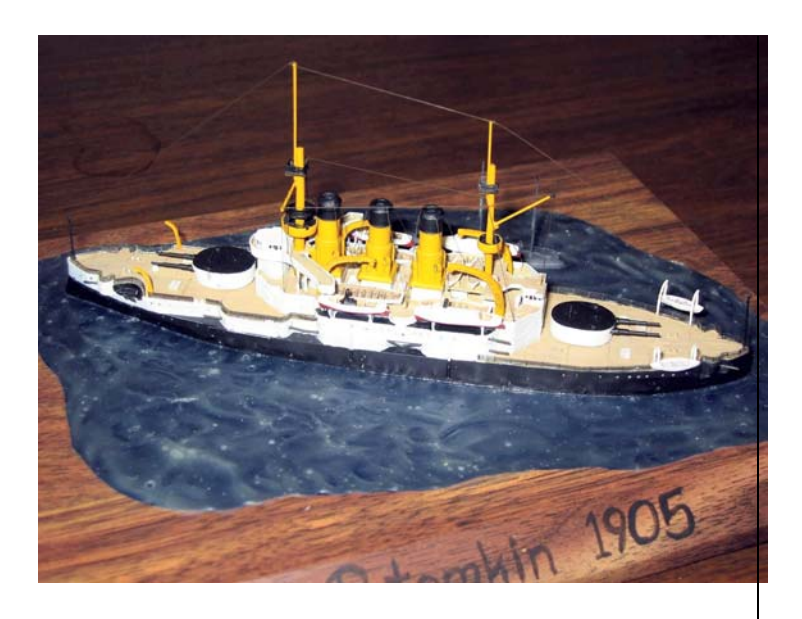
Jeff's Potemkin on a Simulated Sea