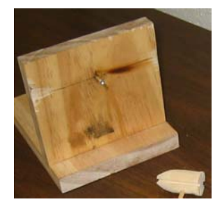
Elements of Dan's Ropewalk

Henry Schaeffer showed his work in progress of the Willem Barendsz II , a whale factory ship built in 1955. Henry is scratch building the waterline model in 1:250 scale and interestingly is using a paper model of the vessel as a guide to the general appearance. A ship of this type would routinely operate with about 16 whale catching vessels that would bring the catch alongside to be processed. Henry intends to show the model with a catch vessel alongside with some whale carcasses.