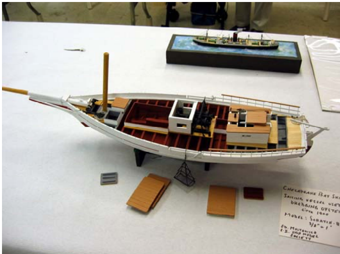
Skipjack by Ed Mostowicz of the Long Island Ship Model Society