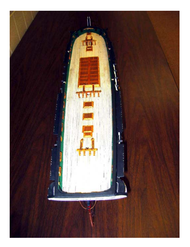
Spar deck of USS Constitution, July 21, 1997