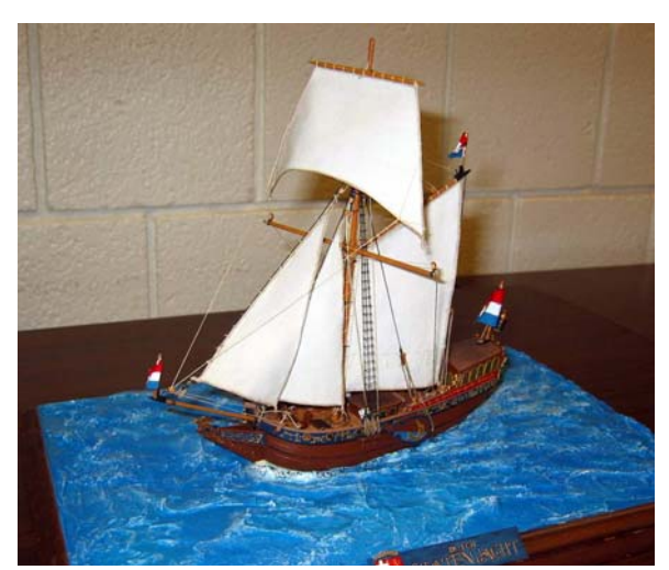
LEN SCHWALM brought back his now completed model of a Dutch yacht of the mid-seventeenth century. Len paid all of 89 cents for this old Pyro model then proceeded to make extensive modifications to produce an interesting small model.