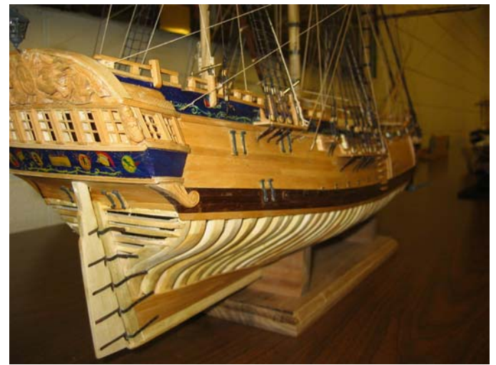
Finally, ALLAN YEDLINSKY brought back his scratch model of HMS Lyme-1740 in 1/4 inch scale. Allan makes steady progress rigging this somewhat daunting project.