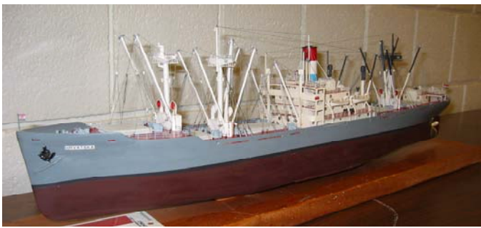
ALEX RADETICH brought his completed model of the American Victory built in 1/16th scale from the Bluejacket kit. The model shows the vessel in a color scheme used when this vessel was under Jugoslavian flag after WWII. Alex actually served on this ship in 1952-55.

with only the rigging to go. Plans are from The Shipmodelers Shop Notes and H. Hahn's book, The Colonial Schooner.