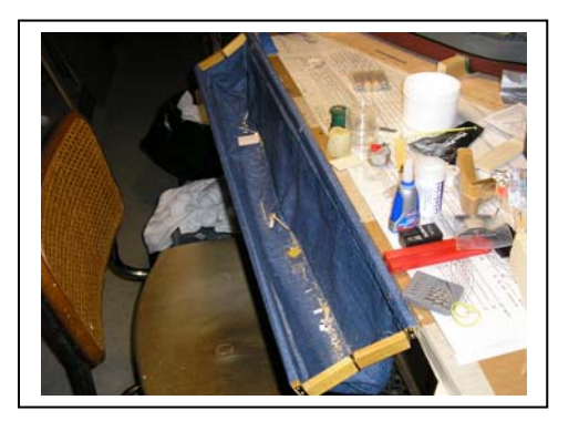
WHAT DOESN'T --

I modified my woodworking bench so it would have a larger work surface by adding an auxiliary top built from a 2' x 4' piece of \frac{3}{4} " birch plywood with a cleat added on the underside so I could clamp it in place with the bench vise. I also covered the top with a sheet of acrylic. I have a nice work area for building my models. The one consistent problem I had with the setup was how often small parts would slip from my fingers or tweezers, off the top and onto the floor. I swear it was like the Bermuda Triangle. The piece would just disappear! I'd be on hands and knees with a flashlight, scouring the floor for that piece. Sometimes I would find it. Other times I'd just give up in disgust. I finally found an accessory that has solved this problem. Since adding it to my workbench, I haven't lost any small parts to my Bermuda Triangle of a floor! The accessory is the "CATCH OF THE DAY" sold by BlueJacket Ship Crafters. I bought the 36" model. As you can see below, it works like a charm.