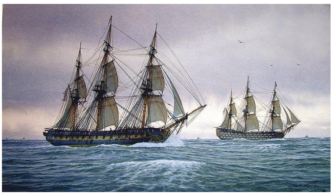
Frigate EURYALUS and HMS VICTORY, the Beat Down-Channel, September 1805 <u>HTTP://jrusselljinishiangallery.com</u>

Allan Yedlinsky showed us a model in 1/4 scale of a Brodie stove used primarily on English vessels of the late 18th century. Fabricating the stove will be a chapter in Allan's second volume on the Euryalus . Any member who would like a copy of the chapter need only contact Allan.