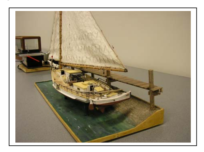
Francois Lachelier's Skipjack