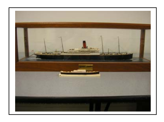
Bob Fivehouse's Minnewaska in 1:384 and 1:1200 scales