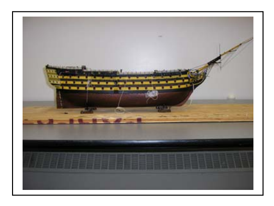
Dan Caramagno's HMS Victory