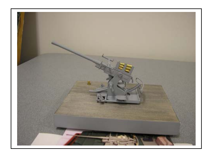
Ossie Thalmann's 37 MM AA gun