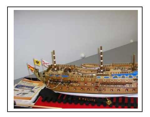
Ernest Connor's San Filipe