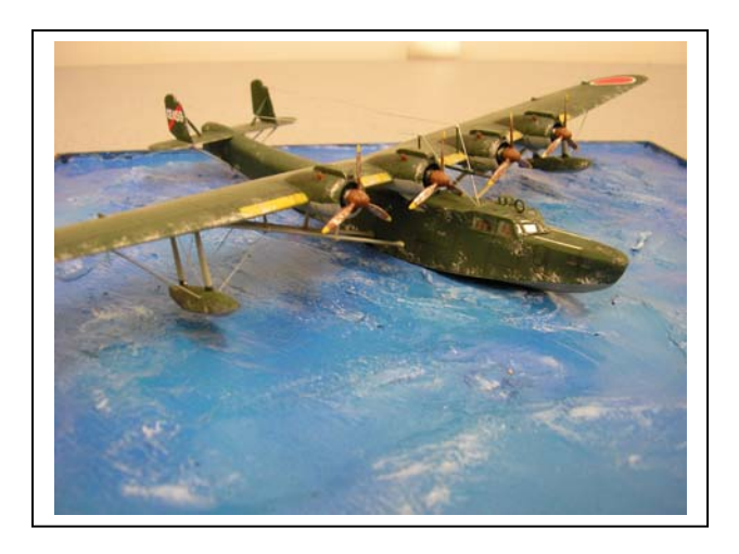
Len Schwalm's Japanese Sea Plane