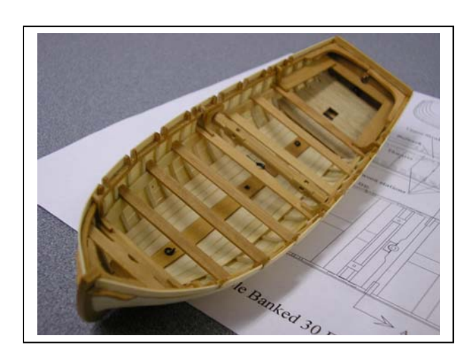
Allan Yedlinski's ship's boat