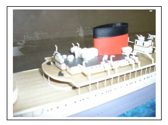
Al Geigel brought in a mahogany case he is building for the model he restored recently which appeared in a previous Show & Tell. Al explained some of his construction techniques which allows access to all of the glass panels should any need replacement.