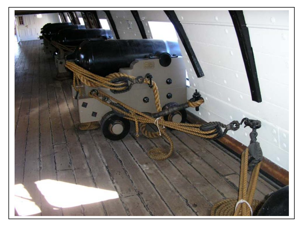
Page 7 of 8